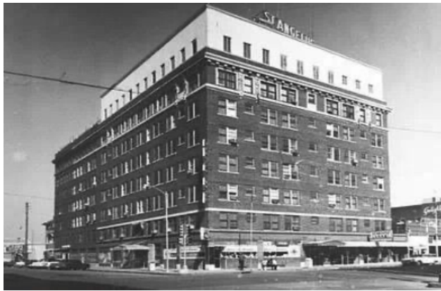
St. Angelus Hotel

From 1960 to 1964 , the firm operated on the ground floor of the historic St. Angelus Hotel in downtown San Angelo.