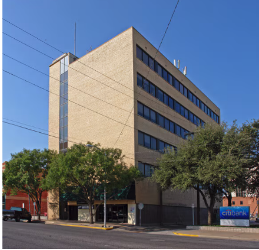
Continental Fidelity Building

In 1979 , Webb, Stokes & Sparks acquired property at 314 West Harris Avenue . After extensive renovations and new construction, the firm moved into its new headquarters—a location that has remained the firm’s home ever since and stands as a lasting symbol of its permanence and commitment to San Angelo.